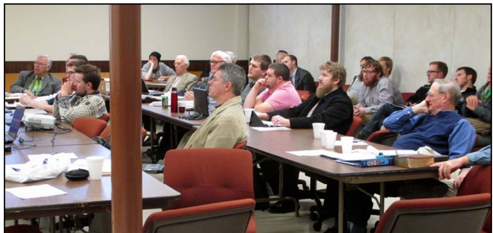
About fifty people attended the January 30, 2015, Seminary Discussion at the Free Lutheran Seminary.