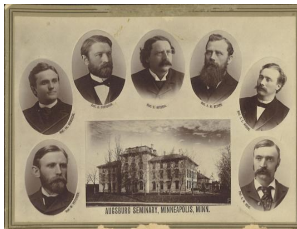
Augsburg Seminary Faculty, circa 1880.